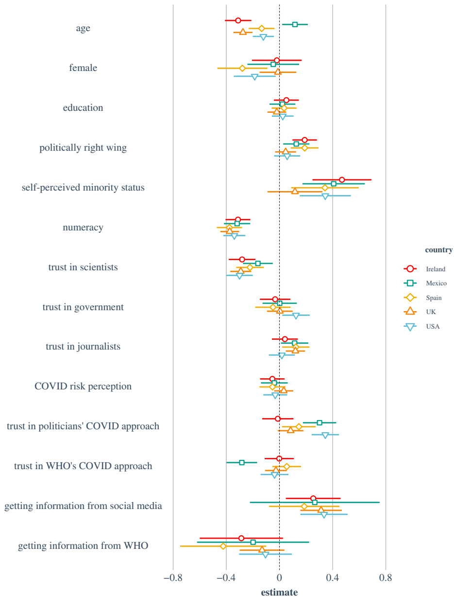
Figure 2. OLS multiple linear regression model for susceptibility to misinformation about COVID-19 by country. Note: results are mean-centred and scaled by 1 s.d. for comparability. Left of the dotted line (i.e. negative values) indicates reduced susceptibility to misinformation.

A number of factors stand out as significant predictors of susceptibility to misinformation across the board. Both higher performance on the numeracy tasks and higher trust in scientists are significantly and consistently associated with lower susceptibility to misinformation about COVID-19 in the pooled model and in all countries surveyed. In addition, being older is also associated with lower susceptibility to misinformation in the pooled model and in all countries, except in Mexico, where the effect is also significant but reversed. 9 Political ideology is significant in three out of five countries; identifying as more right-wing or politically conservative is associated with higher susceptibility to misinformation about COVID-19 in Ireland, Mexico and Spain, but notably not the USA and the UK. Self-identifying as a member of a minority group is also significantly associated with higher susceptibility to misinformation about the virus in all countries except the UK. Higher trust that politicians can effectively tackle the COVID-19 crisis predicts higher susceptibility to misinformation in Mexico, Spain